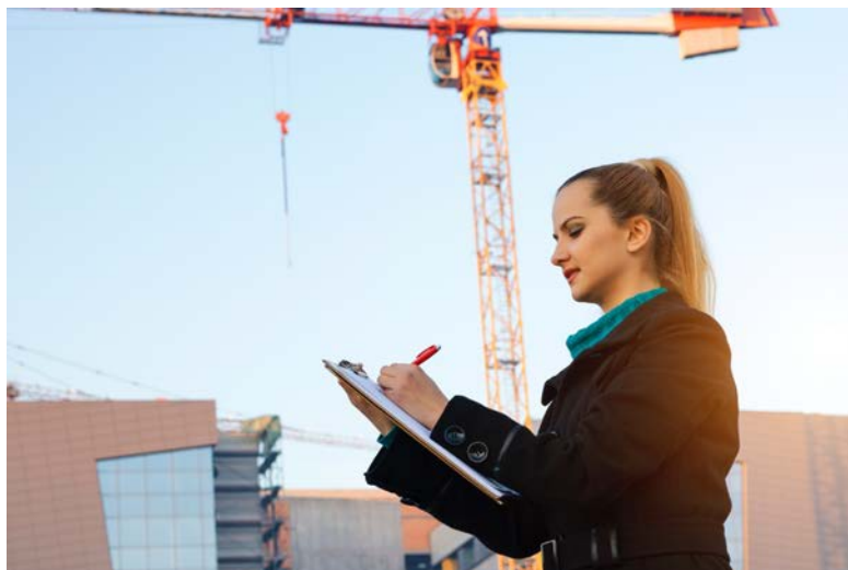
Visitor signing in