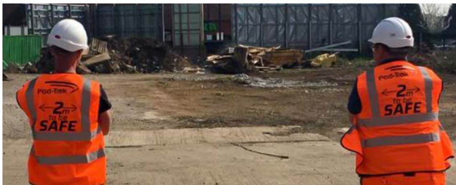
Uniform signage for workers to provide clear messaging

Establishing host responsibilities relating to COVID-19 and providing any necessary training for people who act as hosts for visitors.