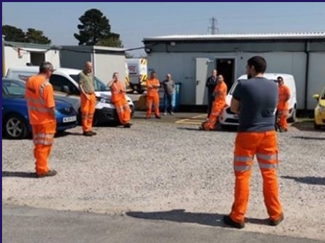
Social distancing during meetings outdoors

Objective: To reduce or eliminate transmission due to face-to-face meetings and maintain social distancing in meetings.